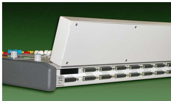
Digital so easy you don't install it—you CONNECT it!

And because it's Auditronics, it's built tough as steel, and will be easy to maintain. Digital CAN be easy—just call AUDITRONICS!